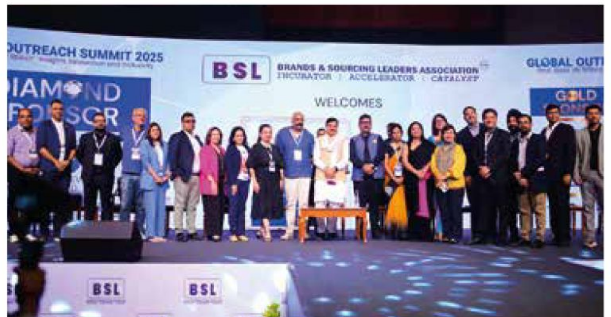
Day 2 | Hon'ble CM MP Govt. of India Dr. Mohan Yadav Esteemed Presence