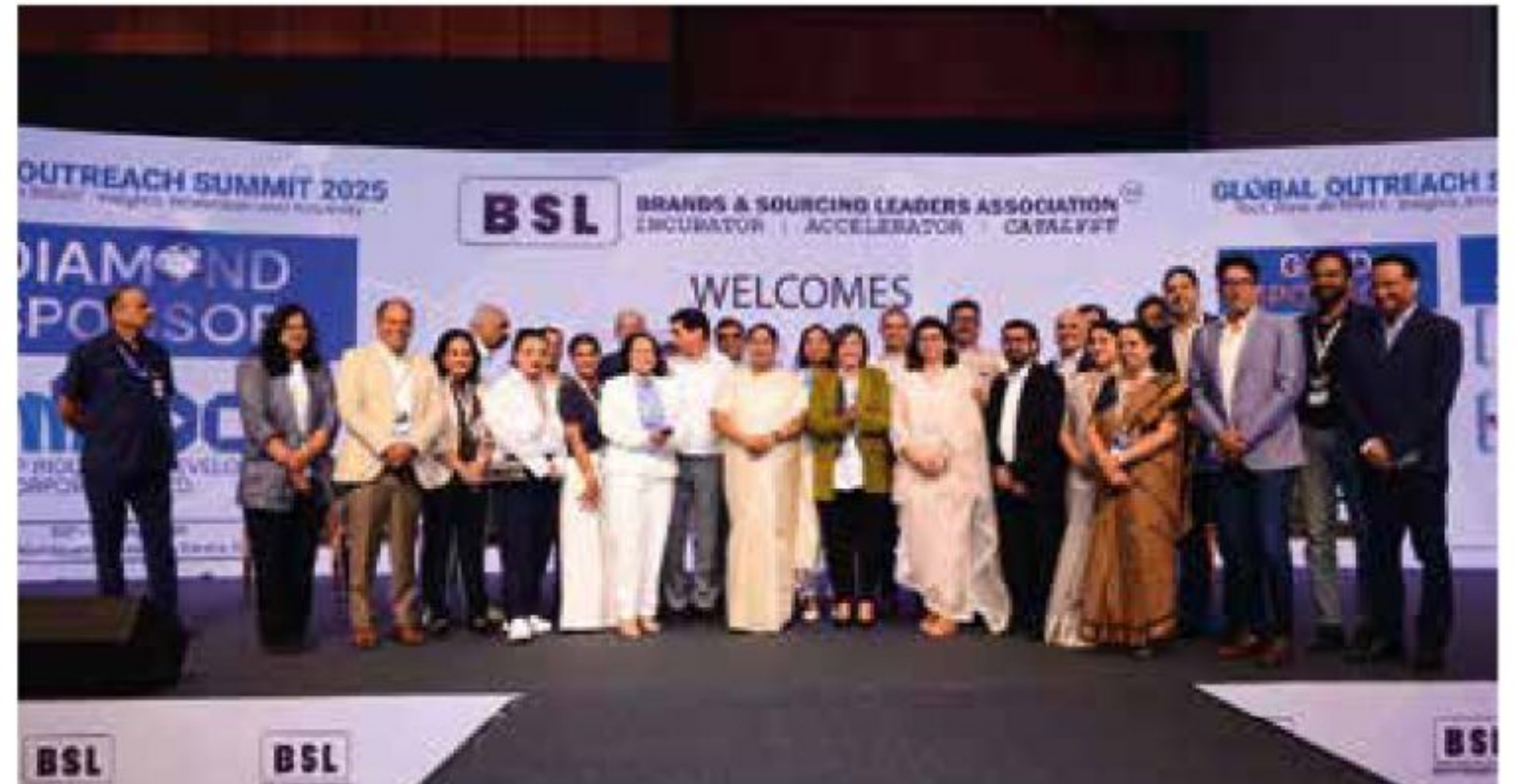
Day 1 | Hon'ble CM Delhi Govt. of India Smt. Rekha Gupta Esteemed Presence