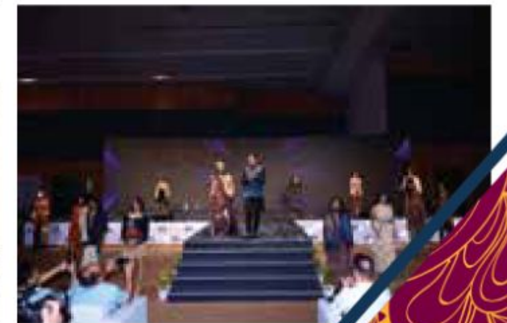
GOS 1 EVENT | JULY 2025 | BHARAT MANDAPAM | THE POWER GALLERY